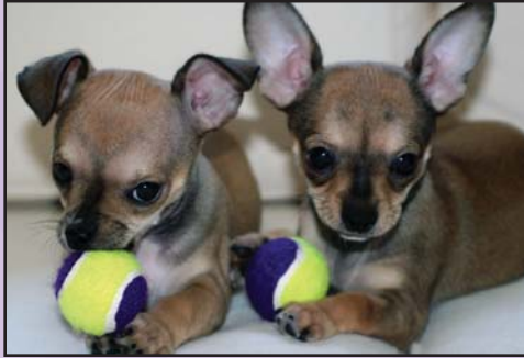
Our dogs, Baz and Lulu

of our families and friends a year later. We can't wait to welcome a child and birthmother into our family, which also includes